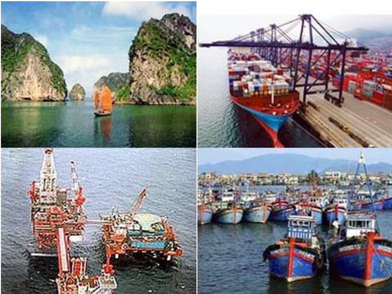
Figure 2. Model for the marine economy of Vietnam

exported or imported by sea; To meet the demand of sea transportation of the economy with high quality, reasonable price and minimize environmental pollution.